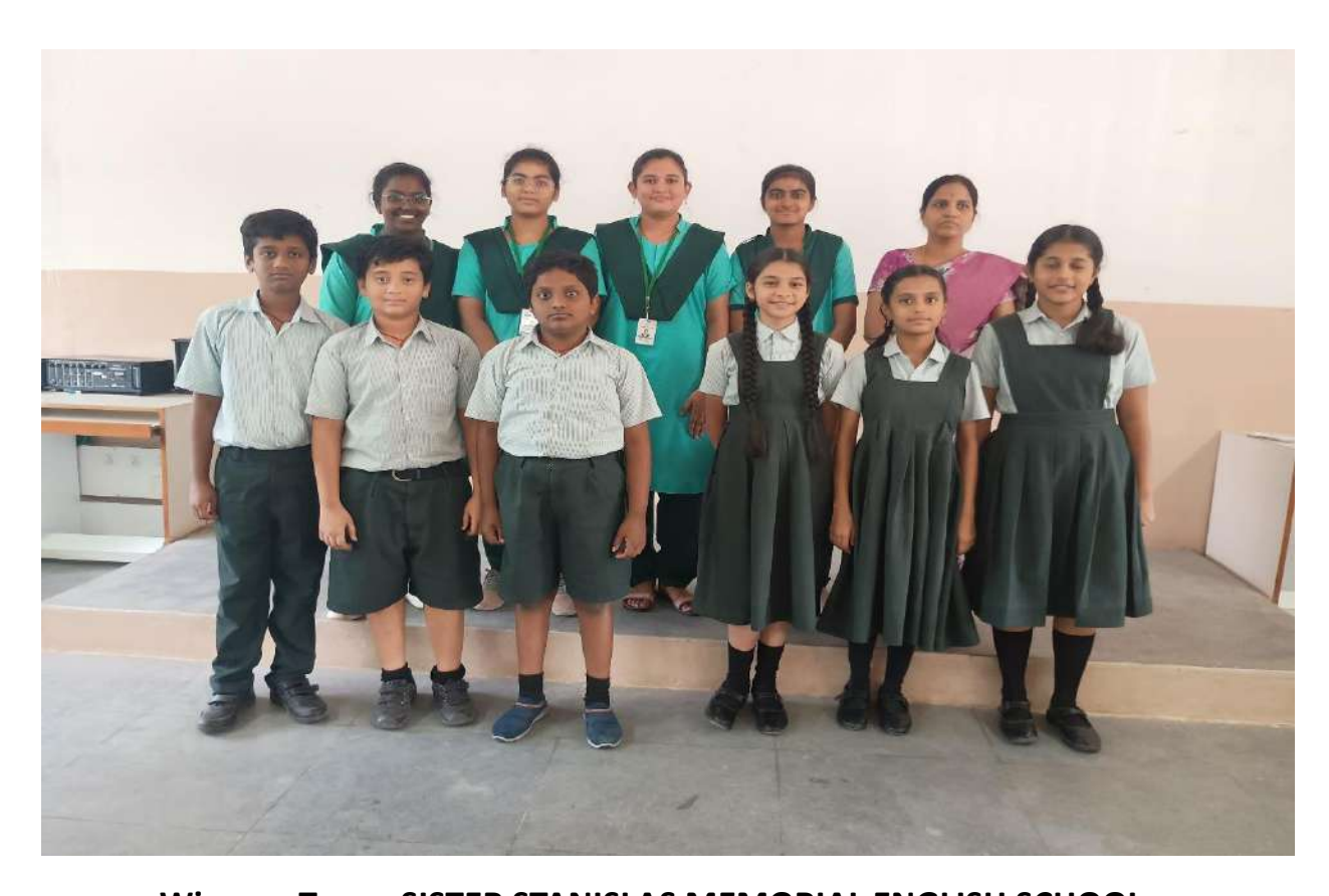
Winners Team: SISTER STANISLAS MEMORIAL ENGLISH SCHOOL